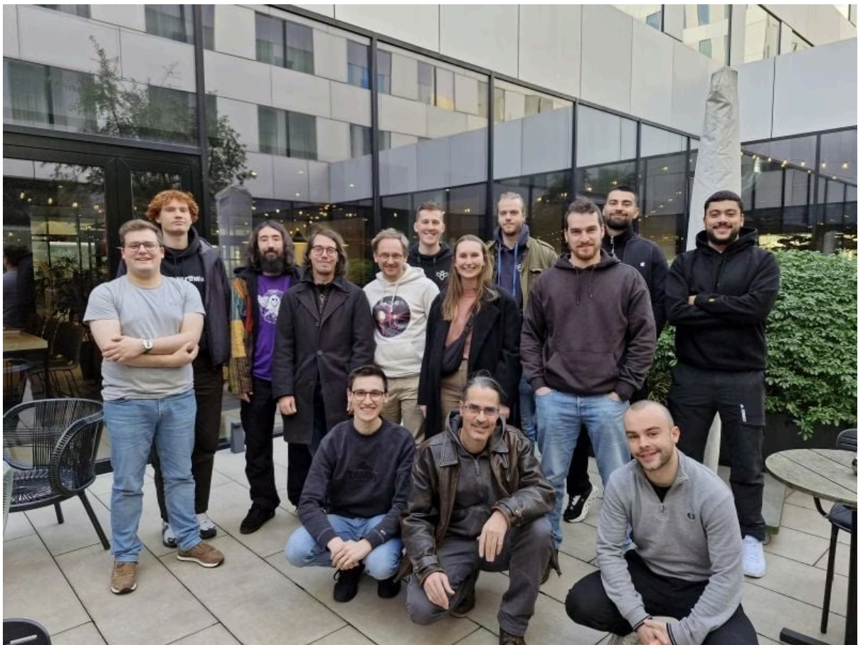
Hackers Team leveled up with Burp Suite training