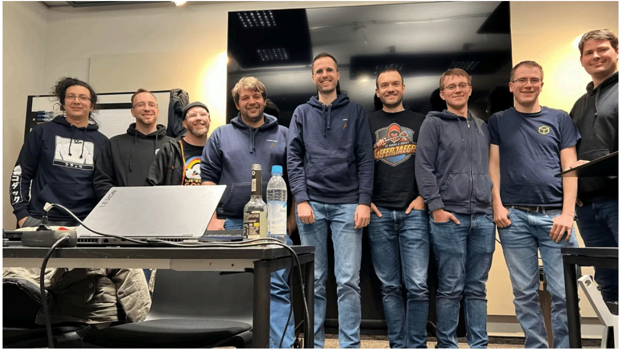
OpenPort Germany Participants