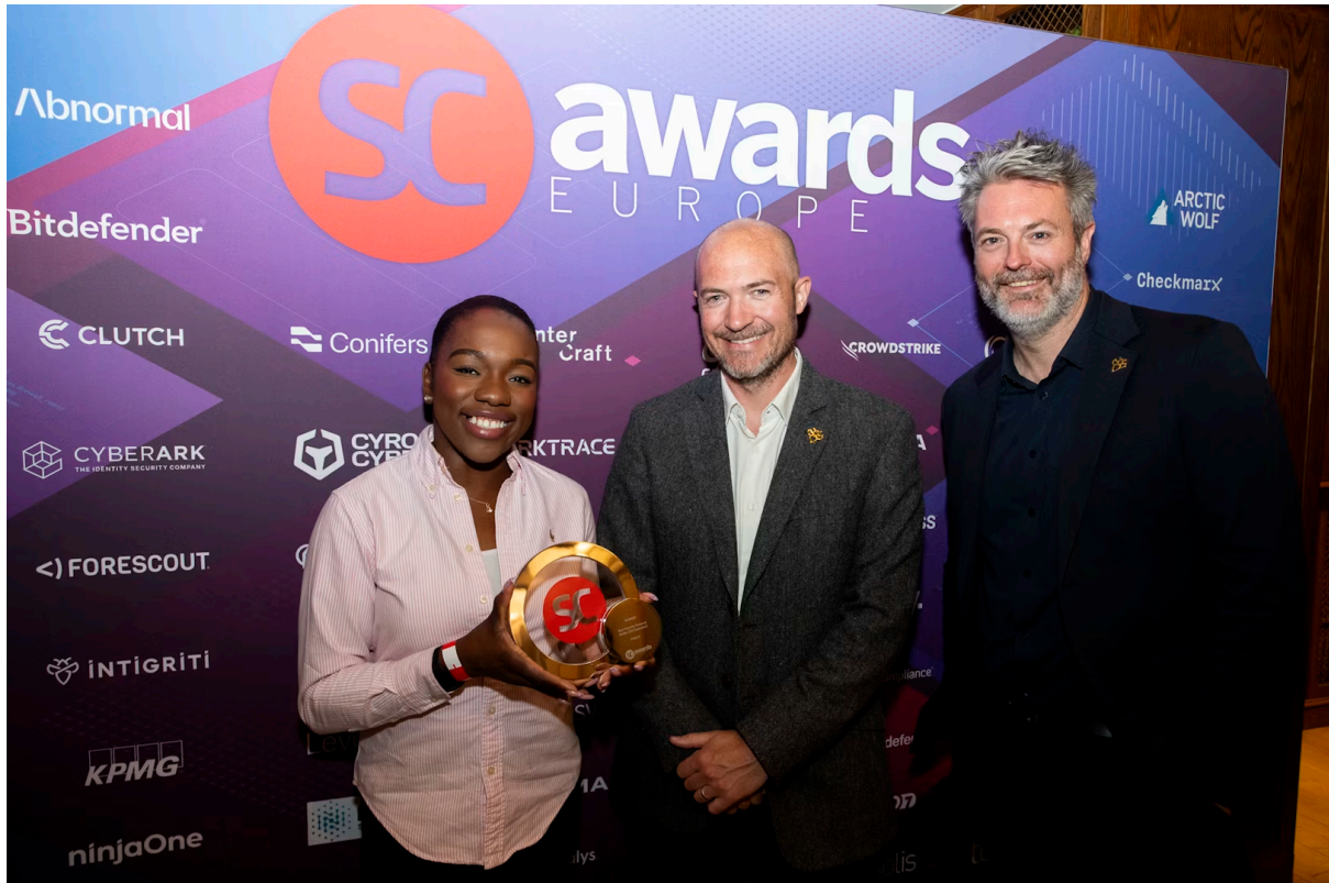
Intigriti Wins Best Security Company of the Year, 2026, SC Awards Europe

We are delighted to share that Intigriti has won Best Security Company (under 250 employees), at this year's SC Awards Europe.